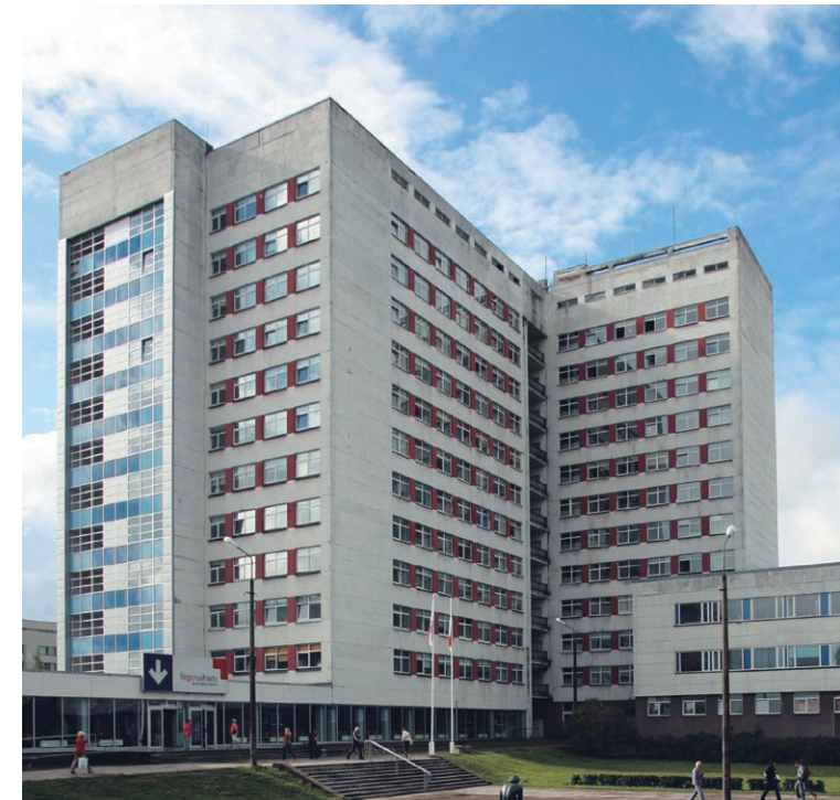
North Estonia Medical Centre

We give planned and emergency treatment in the Department of Dialysis and Nephrology of the Medical Centre. The department has 17 beds for investigation and treatment of people suffering from renal diseases. We also carry out renal replacement therapy – haemodialysis, peritoneal dialysis and the treatment of patients with renal graft. We do about 6000 dialyses annually.